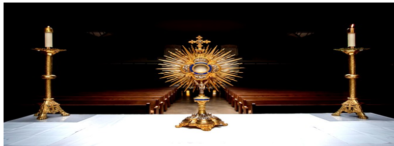
See inside bulletin for more details on Adoration

St. Josemaría Escrivá, the founder of Opus Dei, once said, "You say that you don't know how to pray? Put yourself in the presence of God, and once you have said, 'Lord, I don't know how to pray!' rest assured that you have begun to do so." At that point, simply talk to him about whatever's on your heart: "about him, about yourself: joys, sorrows, successes and failures, noble ambitions, daily worries, weaknesses! And acts of thanksgiving and petitions: and love and reparation. In a word: to get to know him and to get to know yourself: 'to get acquainted!'"