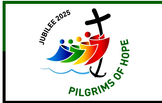
The Jubilee Logo March 2, 2025